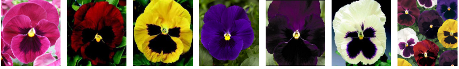
Rose Red Yellow Deep Blue Purple White Mixed