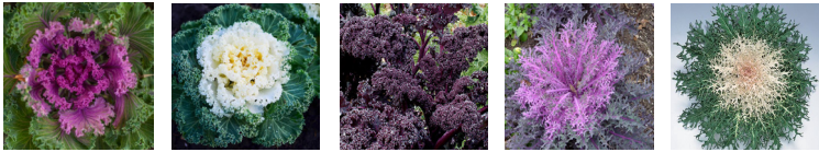
Nagoya Red Nagoya White Redbor Peacock Red Peacock White

PICK UP: SAT, OCT 15, 9-11 AM, AT FIRST CENTER